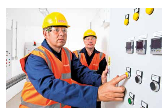
We have invested in nationwide infrastructure and personnel

Ultimately, REMONDIS aims to support its customers by reducing costs, saving raw materials and making a sustainable contribution to the protection of the environment.