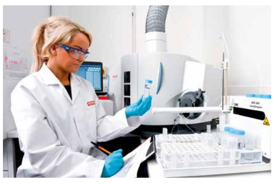
Our state-of-the-art site in Merseyside hosts fully-equipped laboratories