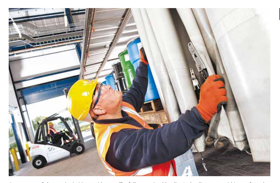
At our state-of-the-art site in Merseyside, we offer fully-contained loading/unloading areas within a safe and secure environment

Through the REMONDIS network, we systematically process solid, liquid or pasty waste into alternative fuels and other products which ensure a completely closed loop material cycle. REMONDIS had the first licence for trans-frontier shipment (TFS) of hazardous waste from the UK to Germany.